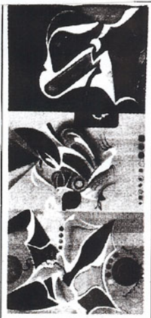
SPECIAL TO THE AMERICAN PRESS

Eugene Martin's "Stereotypes in the West" is a different style of artwork that combines abstraction and use of brilliant colors and weaving shapes on canvases.